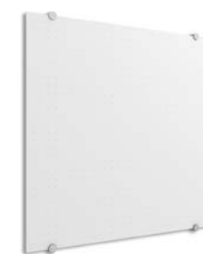
The Dot Grid