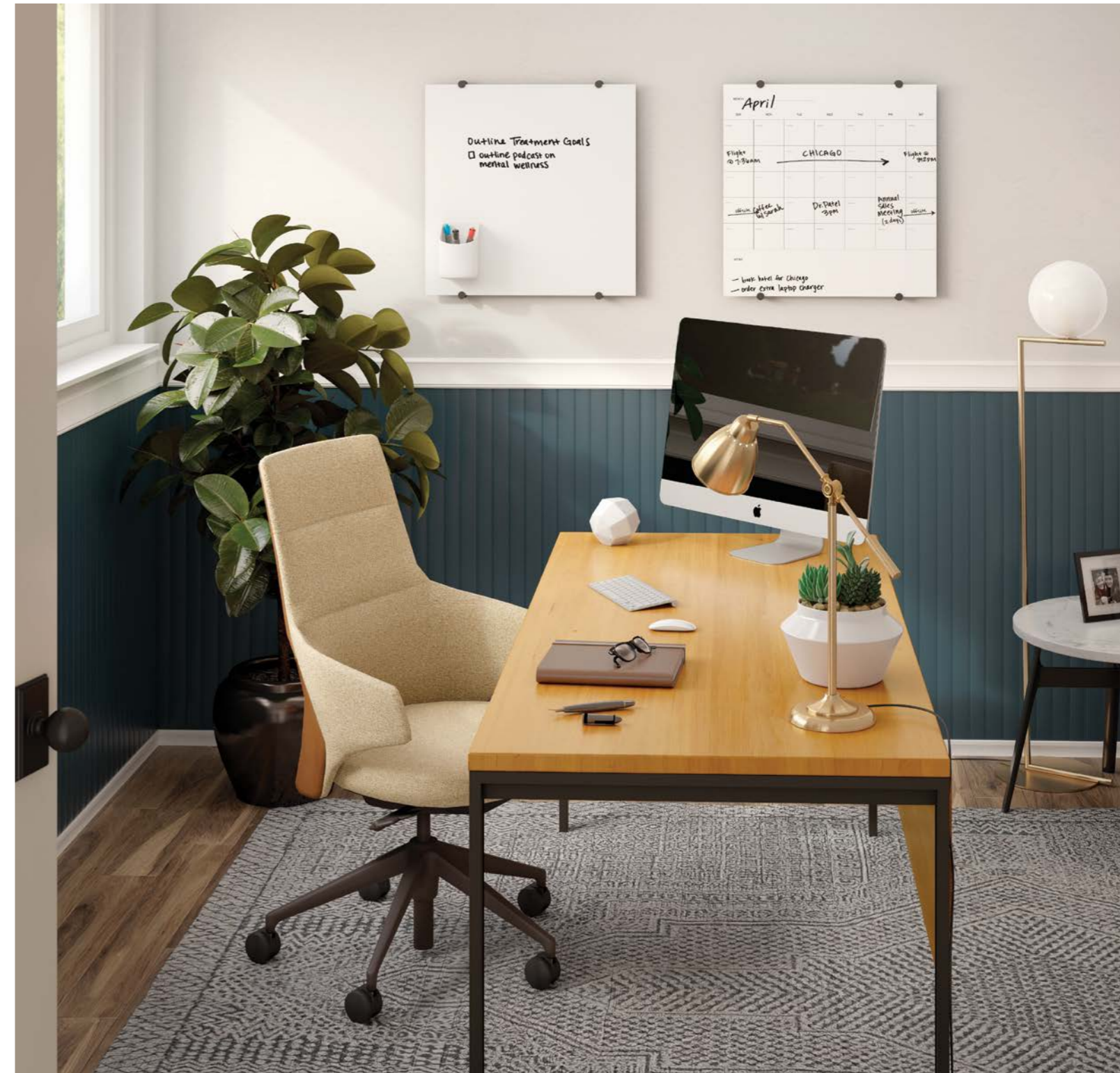
Arctic White Gloss with Black Matte Mounts in the Blank Slate and the Calendar Options

Brainstorm, ideate and jot down notes freely with the Blank Slate design available in white gloss and black chalkboard.