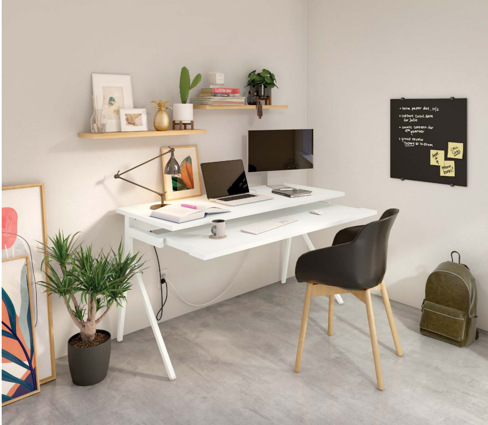
Black Chalkboard with Black Matte Mounts in the Chalk Slate Option