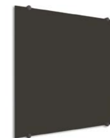
The Chalk Slate