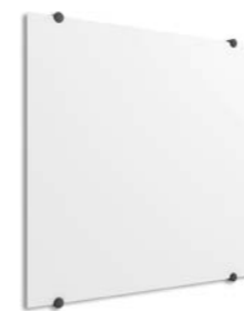
The Blank Slate